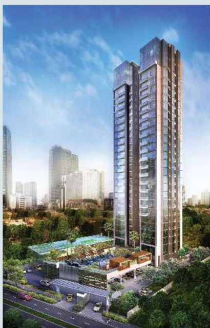
.20 | 20 Menteng Jakarta ▶