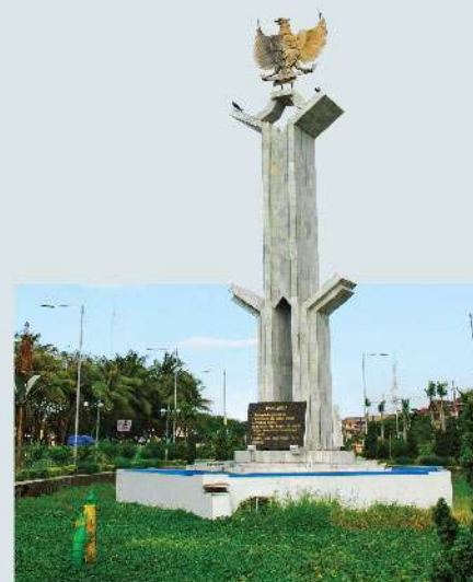
Monumen Pancasila, Sidoarjo ▶