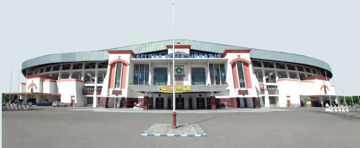
► Gelora Delta Sidoarjo.